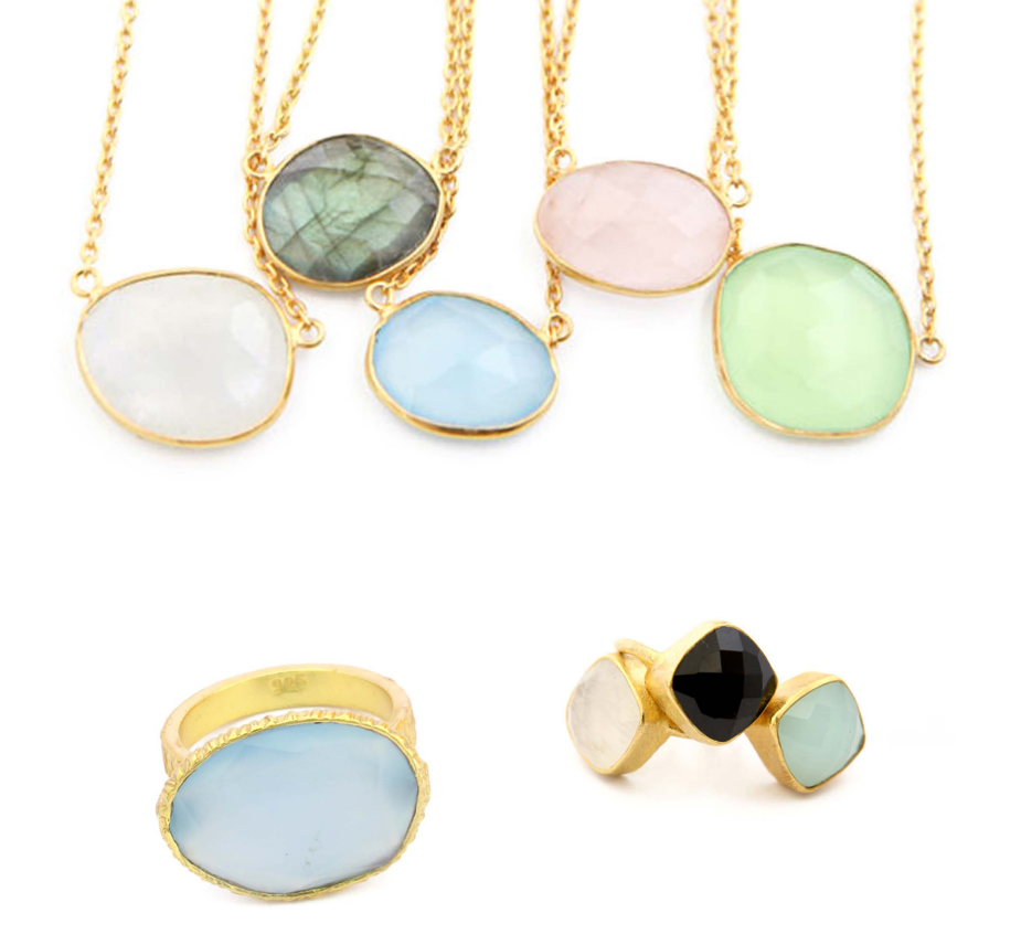
All pieces available in sterling silver and 22k gold vermeil with an assortment of stones for any season.